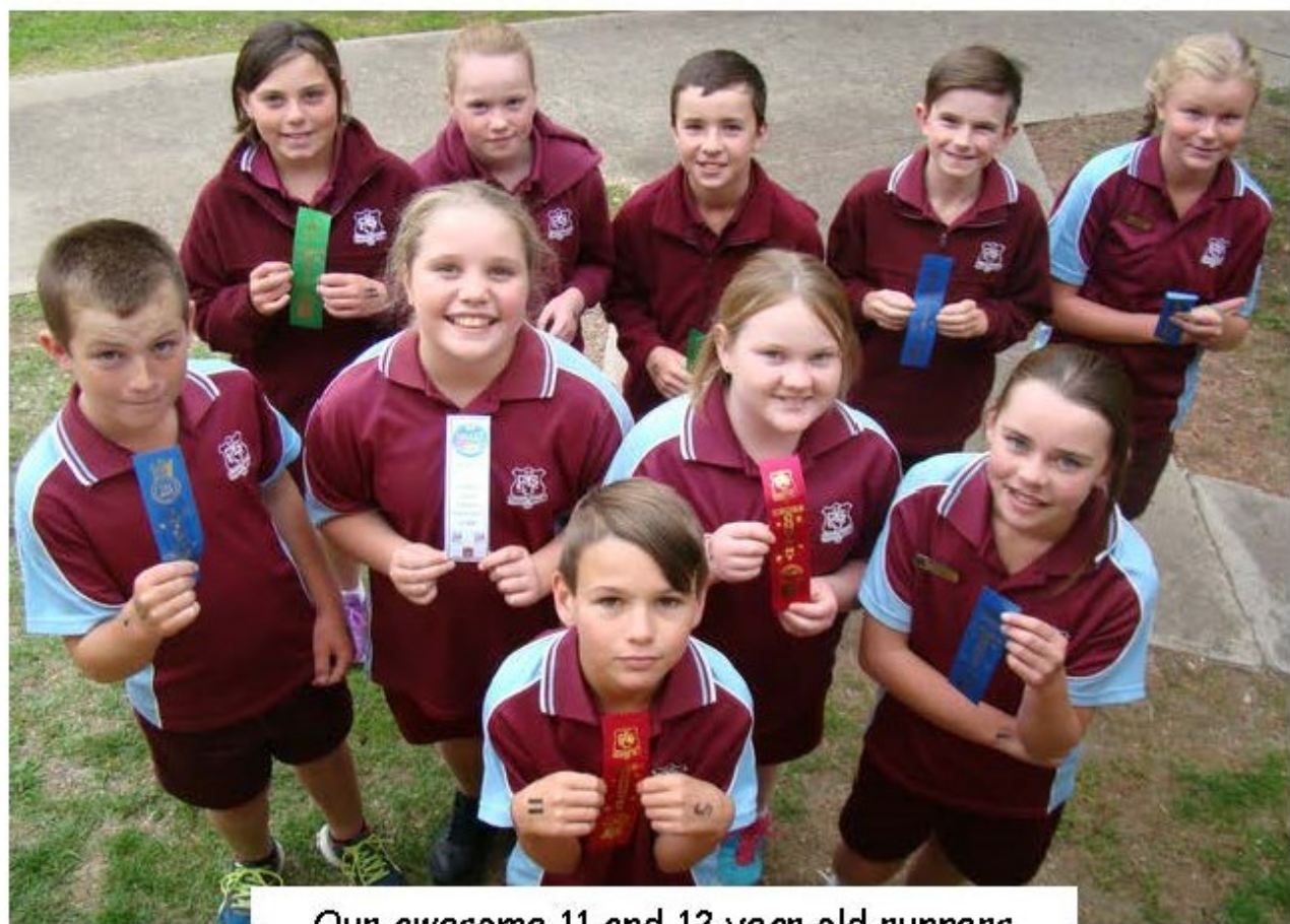
Our awesome 11 and 12 year old runners