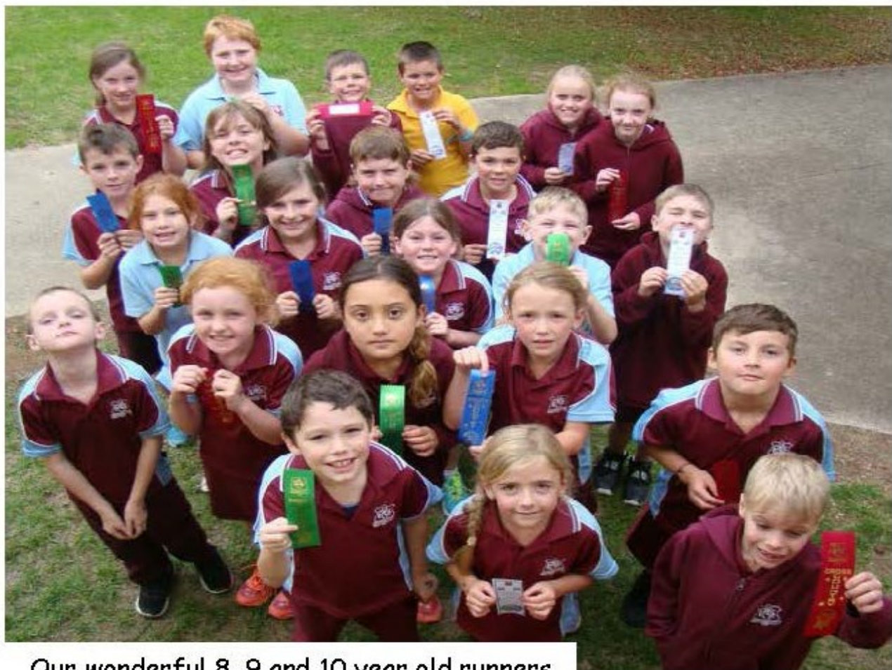
Our wonderful 8, 9 and 10 year old runners