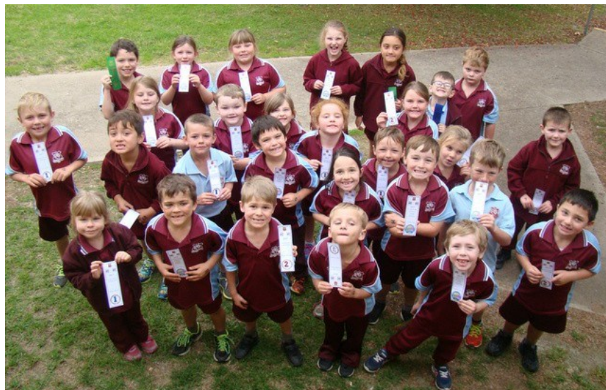
Our fantastic Infants runners