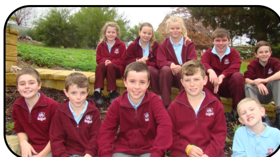
Cross Country Team